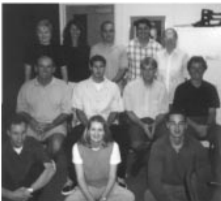
New TA's (L to R)

Thirteen new TAs have begun teaching for the department this semester. As part of their first semester program, they will be attending weekly meetings and workshops to discuss their common syllabus project.